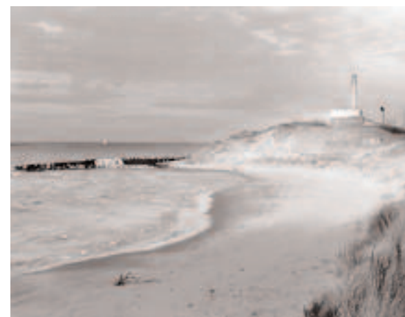
Crescent Dune near Gary, Indiana

"I want them to come and see this as an embodiment of their community," she said. "I want them to come and be proud of their community." ♦