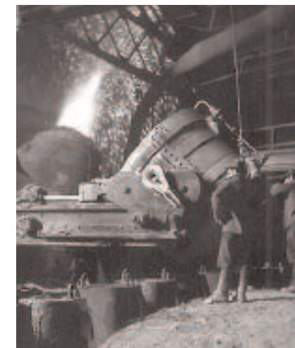
Making steel at a foundry