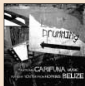
Lebeha Drumming Traditional Garifuna music (innova 209)